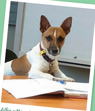
Alfie sitting in on an early planning meeting for the Doggy Day Out.

The plan was to look after Alfie until his leg healed, then he'd be up for adoption like our other pound pups. Interest was high! But behind the scenes we could see Betty and Alfie were developing a bond stronger than ever planned.