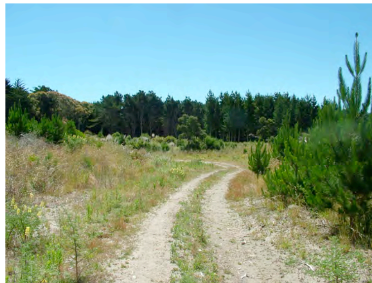
Typical View of Existing Track

The management plan provides land to the Council to make provision for public access.