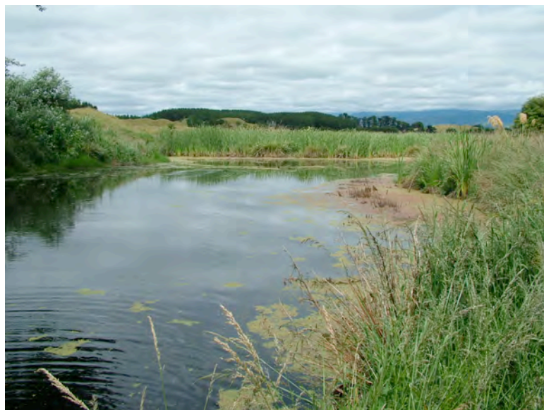
Typical View of Wetland Management Area

BOPRC also provide a summary of wetland values (not monetary value) which include: