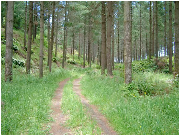
Radiata pine established about 1984 pruned