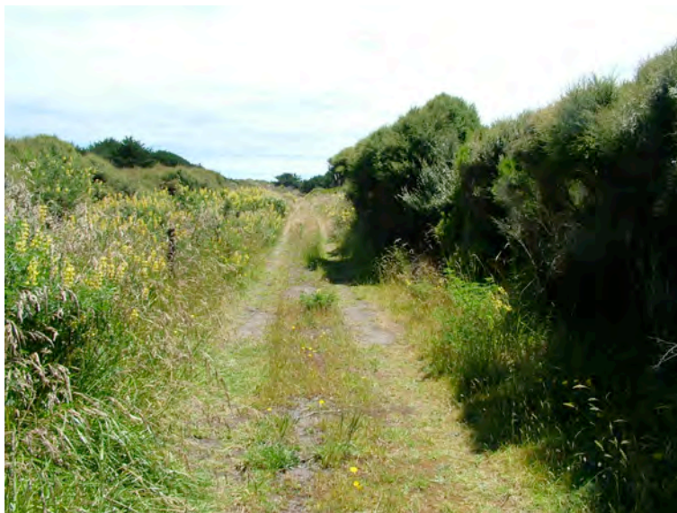
Typical View – land to Vest