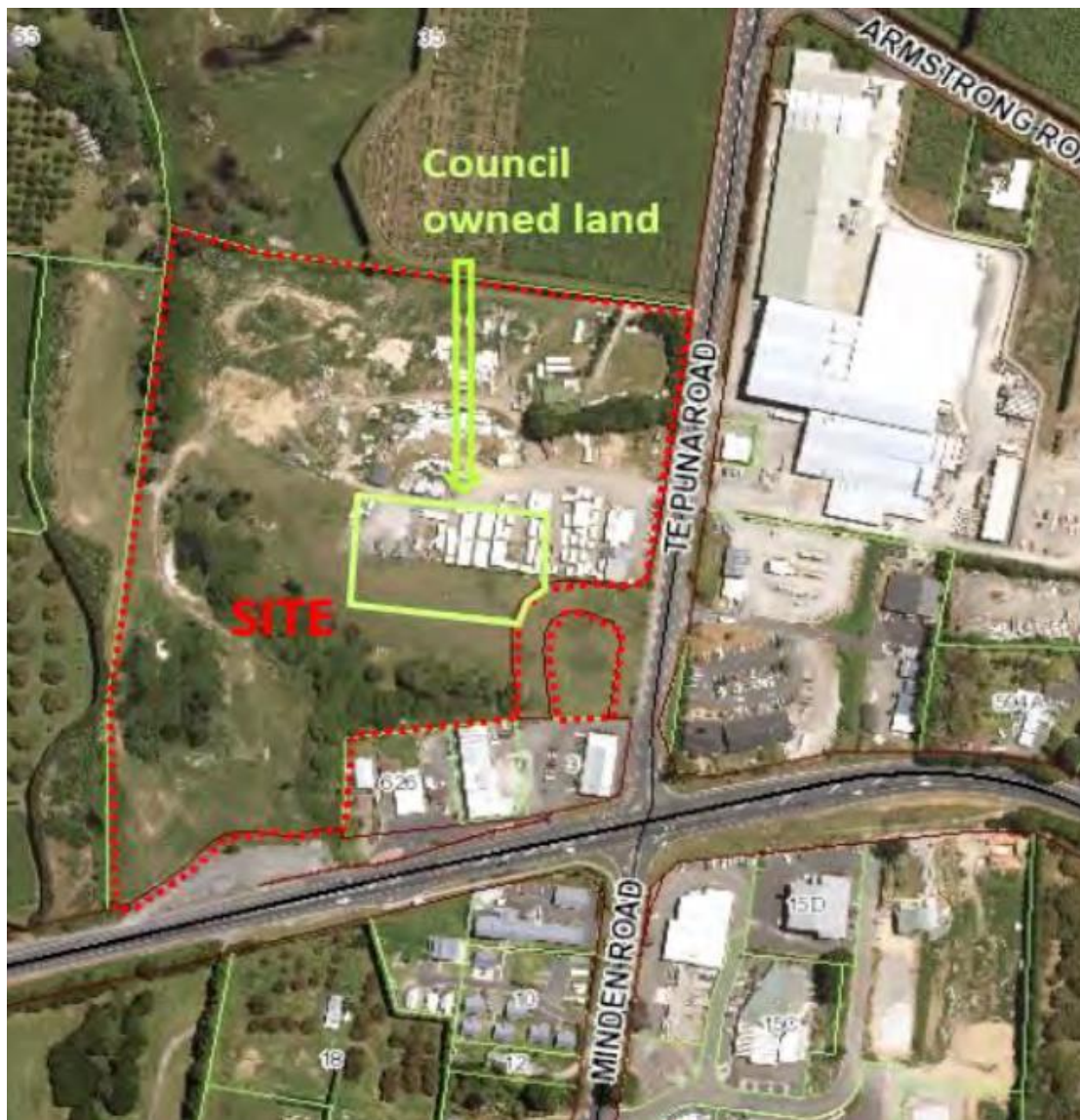
Figure 1: Structure Plan Location