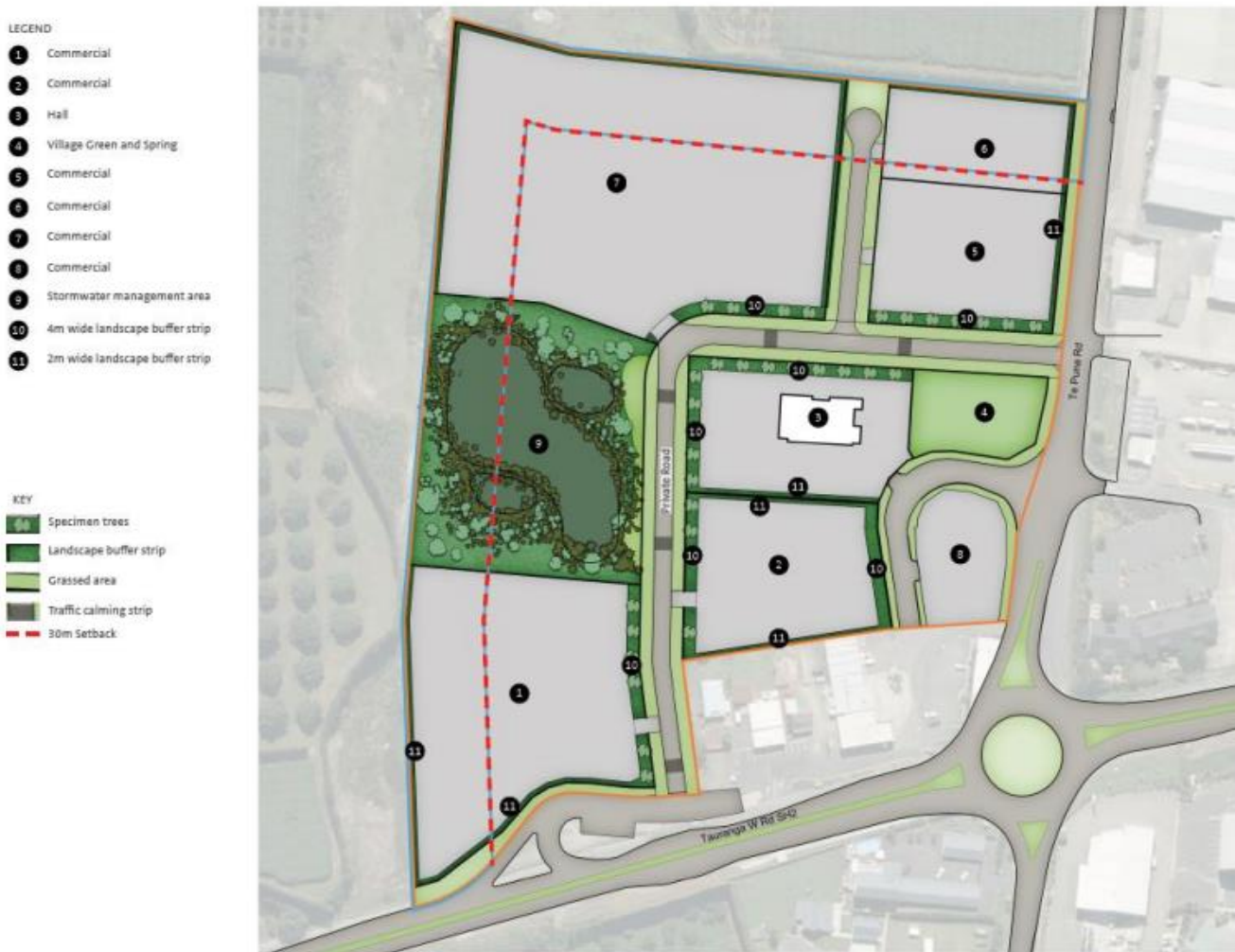
Figure 3: Proposed Structure Plan Map.