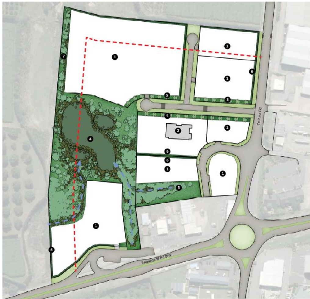
Figure 4: New Structure Plan map

The following submissions are therefore: