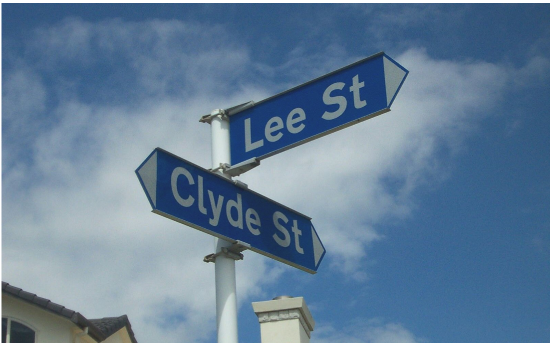
Typical street name sign combination at a T-intersection.