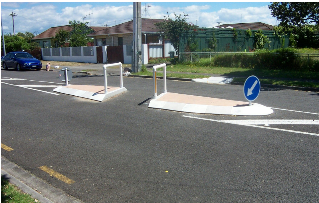
Typical pedestrian refuge layout. (Note, Highway lighting not included in photo)

The typical Pedestrian Refuge design to be used is shown in Figures 3.1 to 3.2. Lighting is to be to the standard specified in NZS 1158:1997.