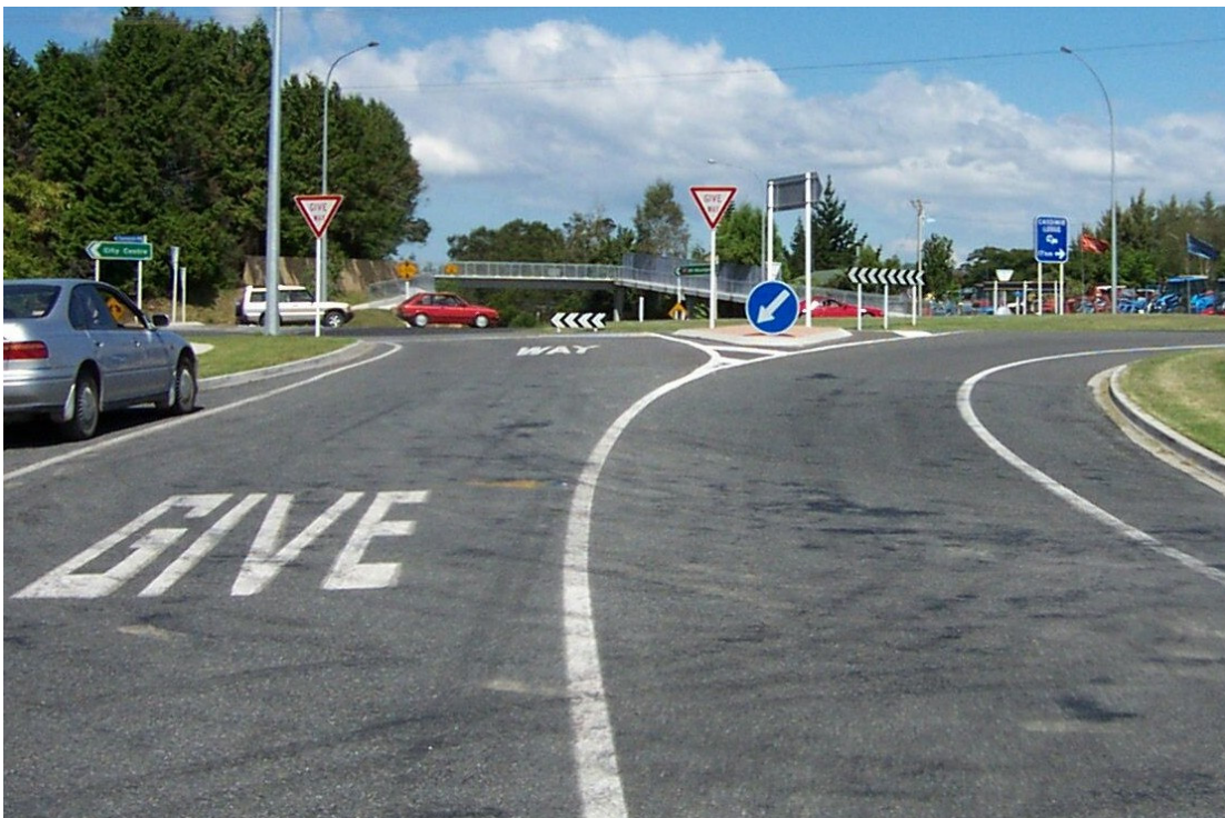
Typical RG-6 layout at single lane roundabout.

When appropriate, a supplementary RG-6 sign may be mounted on the splitter island facing the approach. The sign must be mounted either at 1m or 2.5m in height above the adjacent pavement surface. However, on multi-lane approaches, the supplementary sign is mandatory and should be mounted at the normal height.