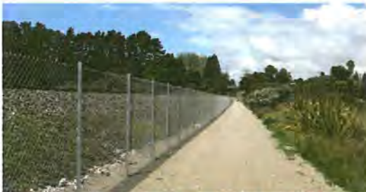
Fencing installed to Jess Road Wetland (13/11).