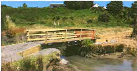
Flat rack installed at Huharua Reserve (photo courtesy of WBOPDC Facebook page).