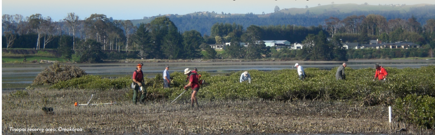
Tinopai reserve area, Ōmokoroa