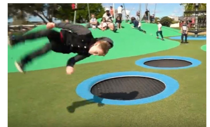
11. Mini trampoline examples