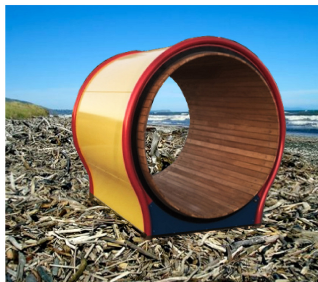
5. Mouse Wheel example