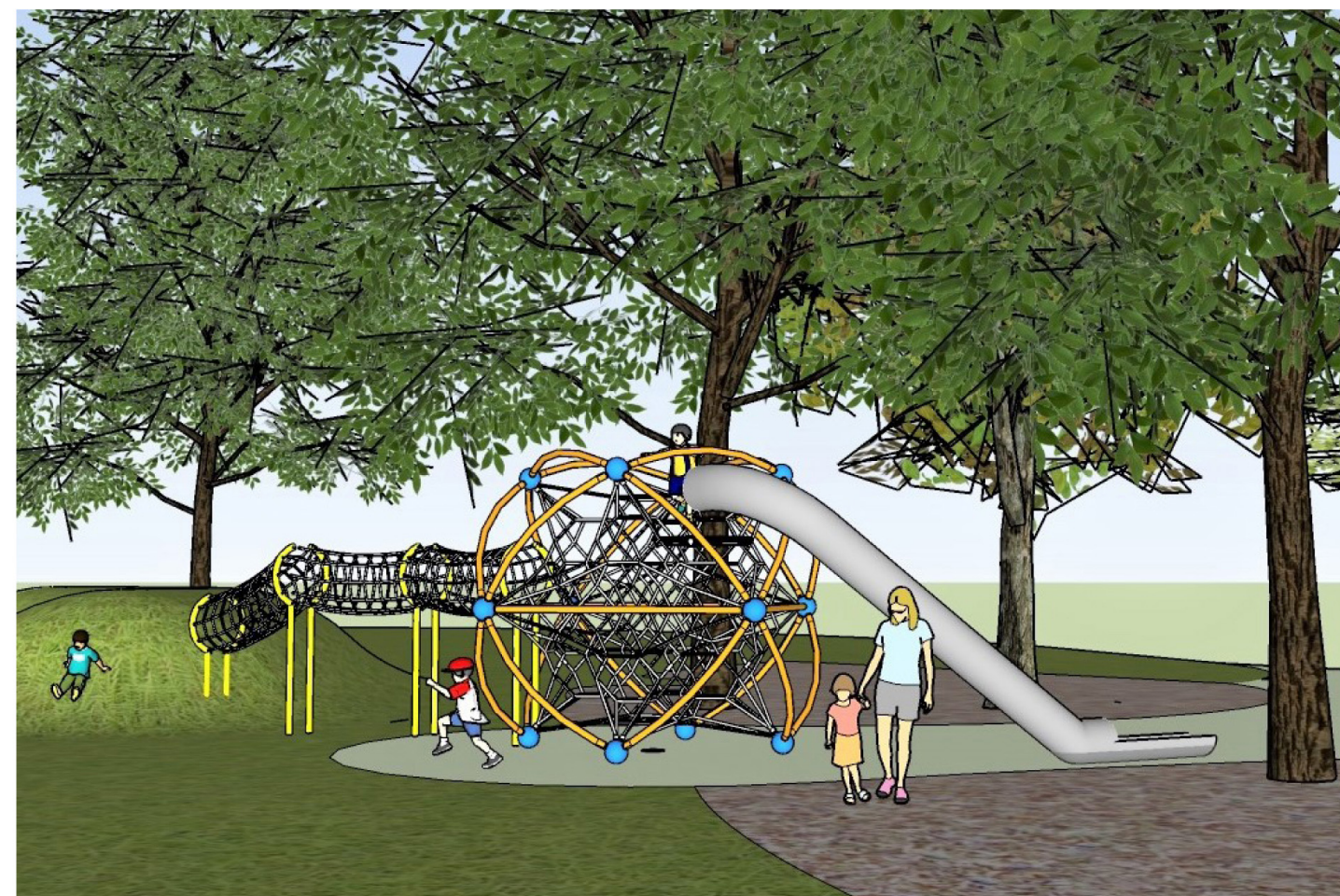
4. Tension-net climber, slide to sand and rope bridge sketch concept