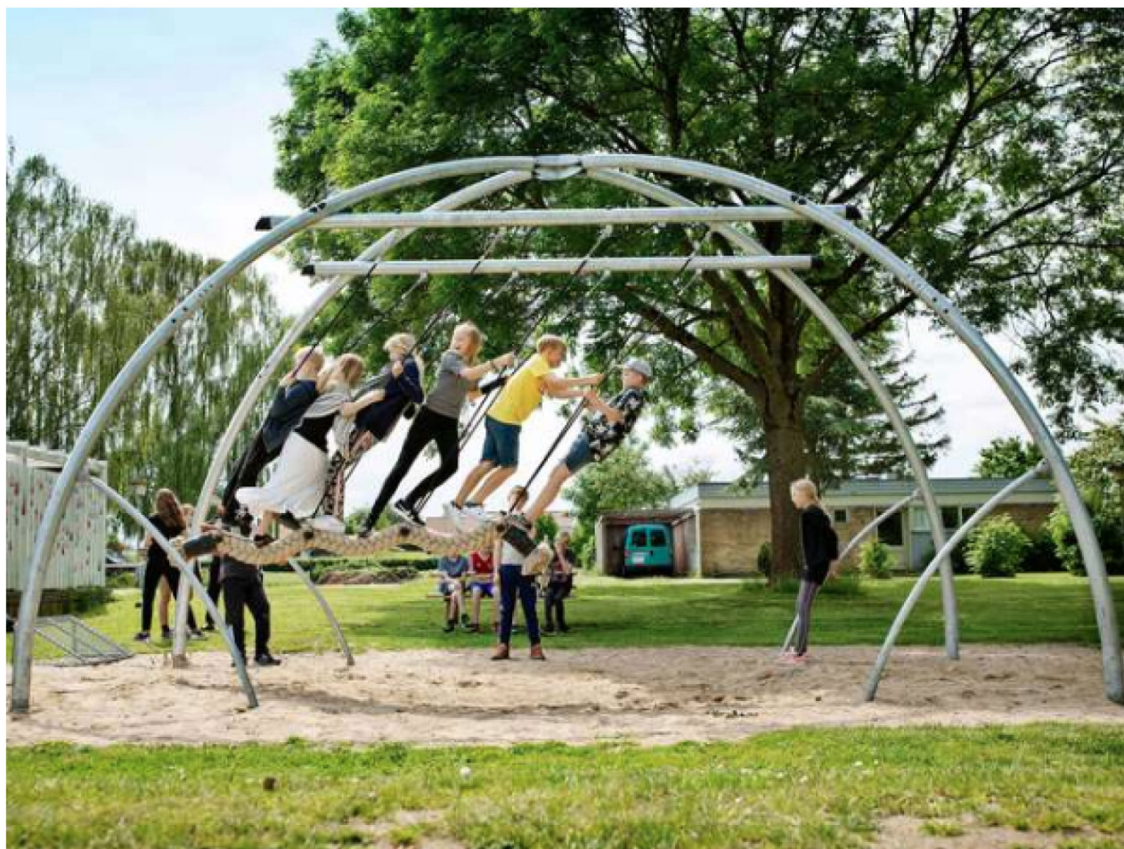
1. Pendulum swing example