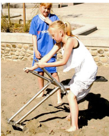
2. Sand Play equipment example