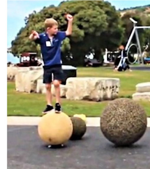
7. Balancing equipment examples