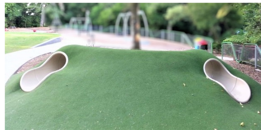
9. Junior mounded area examples including climbing wall, tunnel, embankment slide