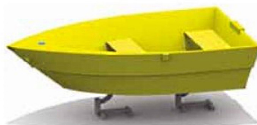
3. Junior Springy themed example