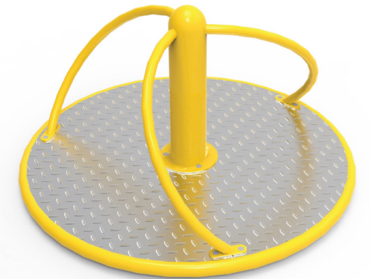
8. Carousel example