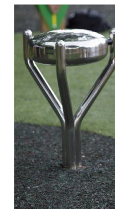
10. Outdoor music example