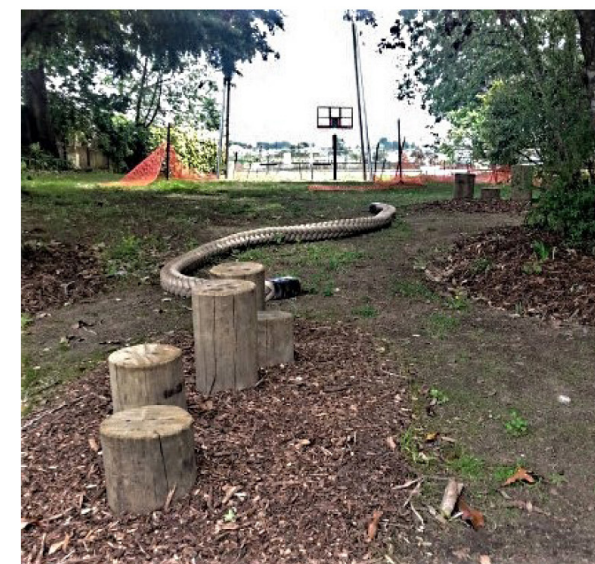
6. Obstacle equipment and climbing gym activity examples (see also Sheet B sketch)