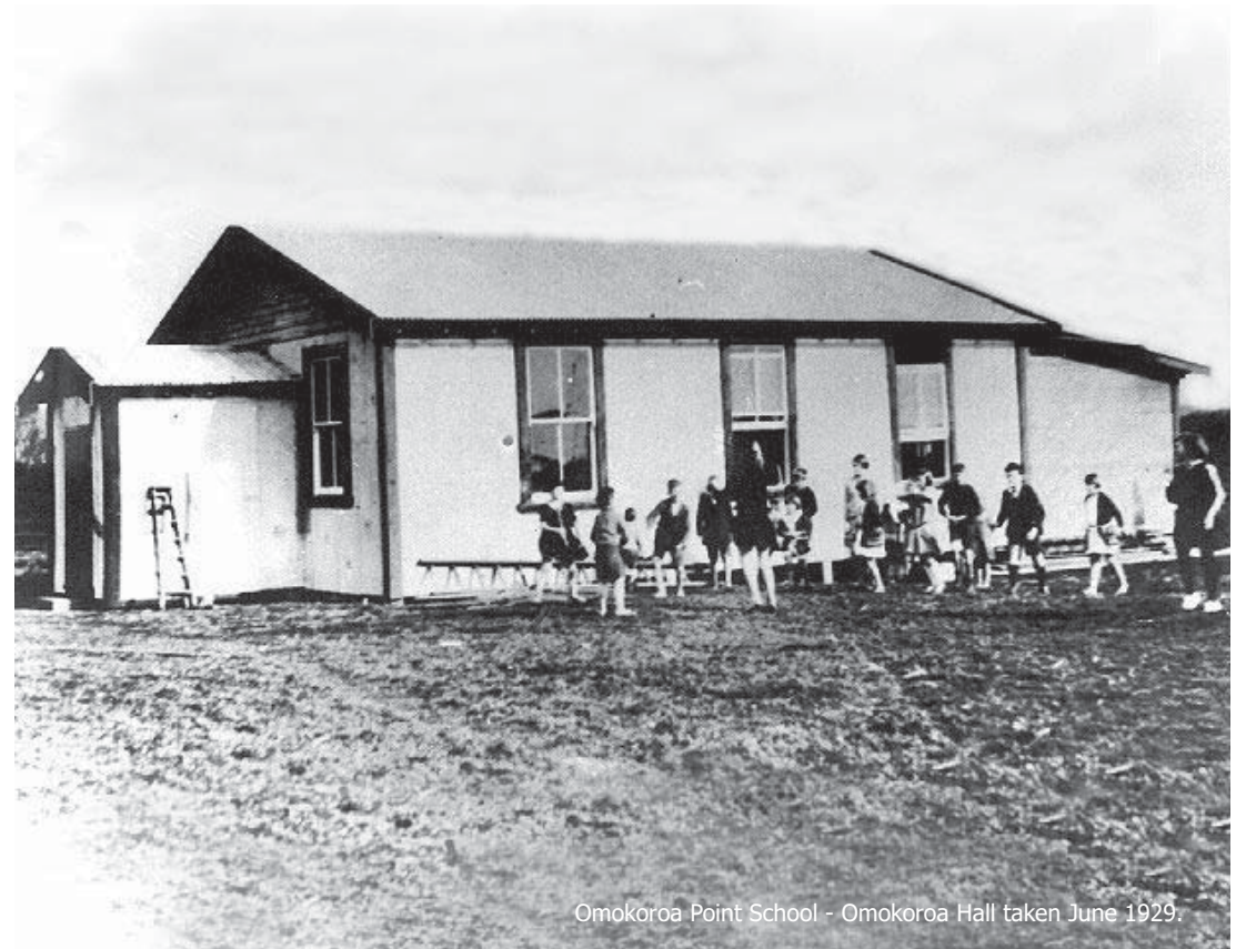
Omokoroa Point School - Omokoroa Hall taken June 1929.