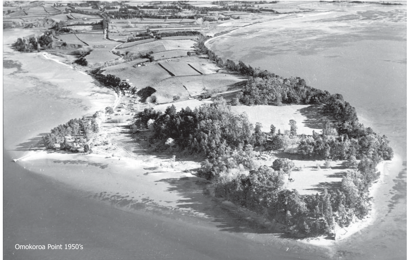
Omokoroa Point 1950's

In the early 1900s-1940s there was more settlement of families and the establishment of pastoral farming, mainly dairy. The beach has long been valued for recreation and commerce and also access to the harbour and Matakana and Motuhoa Islands. Omokoroa is a traditional landing and embarkation point for the people of Matakana Island. The wharf was used to convey produce and livestock. Boat trips from Tauranga brought people out to Omokoroa for picnics and baches started to be built in the 1940s as holiday homes. From 1960 there was a shift to horticulture, lifestyle and urban living.