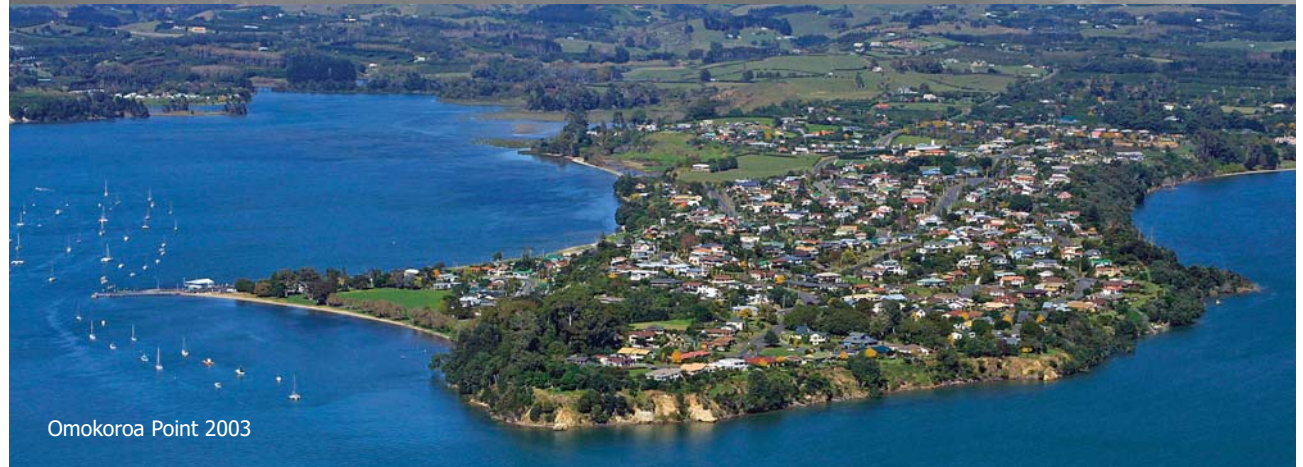
Omokoroa Point 2003